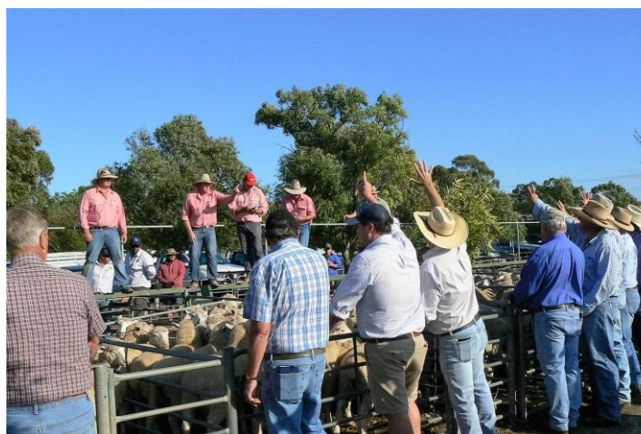
The Elders team selling to buyers in action at today's sale.

The next scheduled sale is Thursday 6 th April 2017.