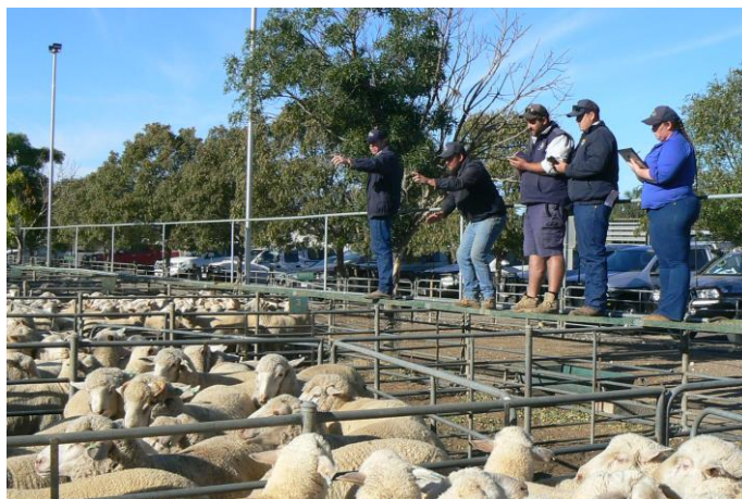
BR&C Agents during the auction today

The next scheduled sale is Thursday 21 st March 2019.